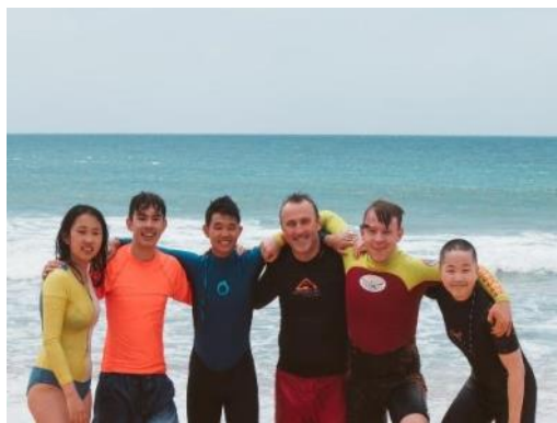
Patrol 1 Bronze proficiency