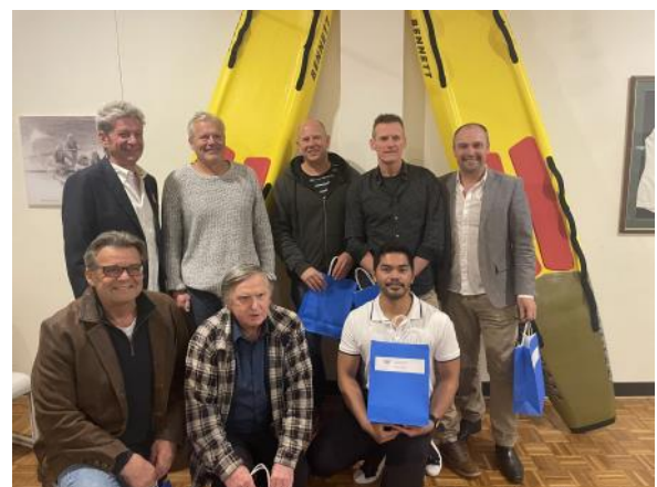
Top 10 Patrollers—by hours