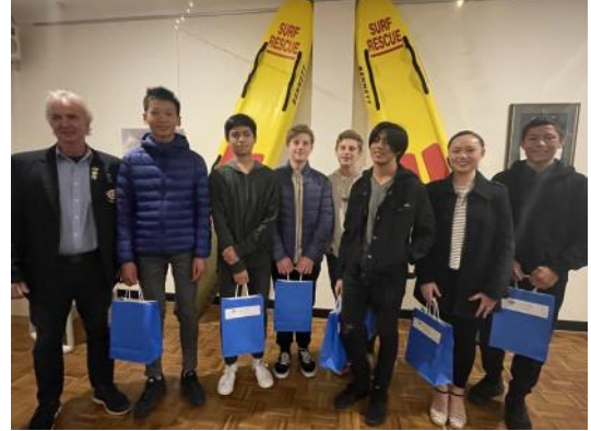
SRC Thanks for Nippers Water Safety