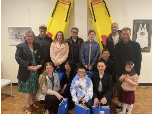
Club Championship Awards