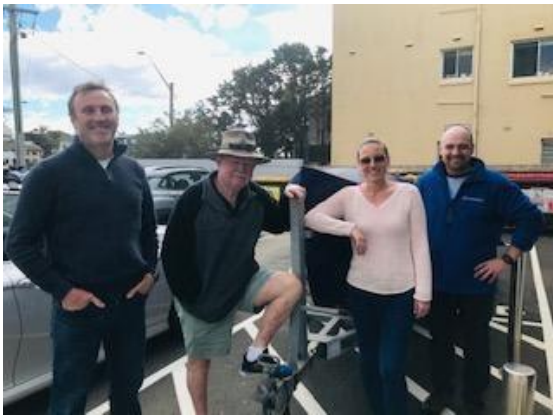
The Building Sub Committee

And now 3 out of 4 major building works have been completed and the 4 th will start in 2022 to avoid a repeat of building work at the start of the next Patrol season. The combined cost of these 4 building works now exceeds $1.2m.