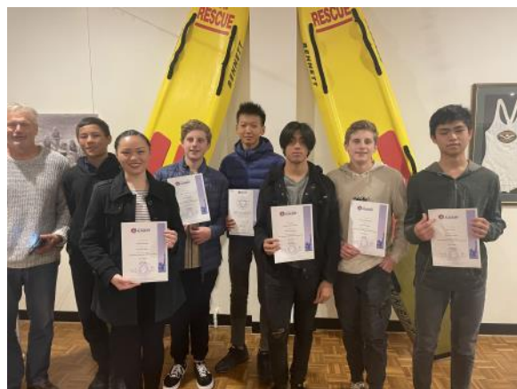
Our Awesome SRCs—Surf Rescue Certificate