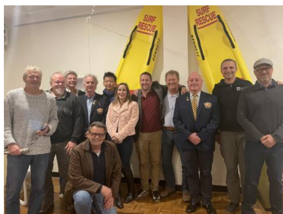
First Aid Awards