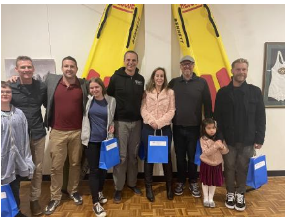
Patrol of the Year—Patrol 2