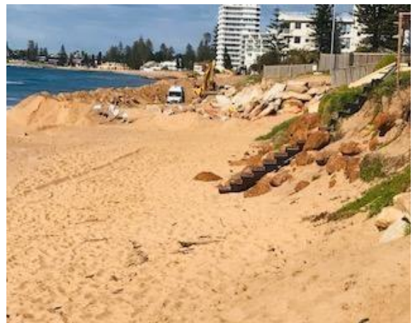
Seawall constructions May 2021

The Club is very focused on this ongoing construction which is now at our Club boundary. We have discussed with Council the likely impacts to our ATV access ramp and pedestrian access issues. We have continued to ask for a permanent set of stairs on our Southern boundary, a suitable ATV ramp to provide access in all erosion conditions and a sediment trap off Mactier Street to be included in the building work. I can't stress enough the importance of getting these matters right before the steel and concrete goes in.