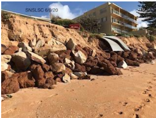
6 th September 2020

We started the season without a beach. As this photo shows the erosion was significant. So much so that it revealed for the first time the reef that lies beneath our beach.