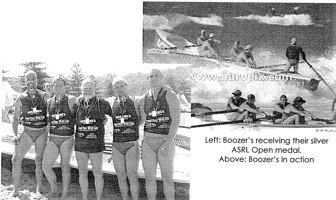
Left: Boozers receiving their silver ASRL Open medal. Above: Boozers in action

The crew all had a fun season getting some top results and making most finals, with the best result being the ASRL Open picking up the silver. They also picked up the silver in the SNB Branch Pointscore, which meant that the 'Boozers' were consistent over the entire season. These boys had a fantastic season all in all winning a few medals along the way. Not bad for a bunch of "Boozers"