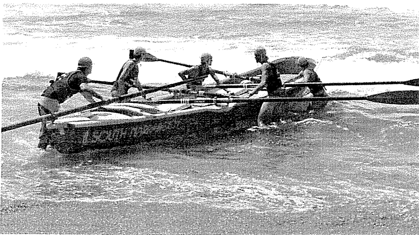
Nuffies in action

This season was the 'Nuffies' first year in the big fibreglass boat. They didn't really get going until late January when Moose took over at the helm. Their first Carnival was the ASRL Open at Newport where they found out how fun Surf Boat rowing really is by Moose putting them down the chute to initiate them. These guys still have two seasons of Under 19's to contend, so some hard training will see some results in years to come.