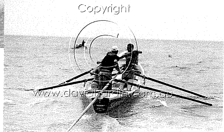
Right: Jaffa's in action