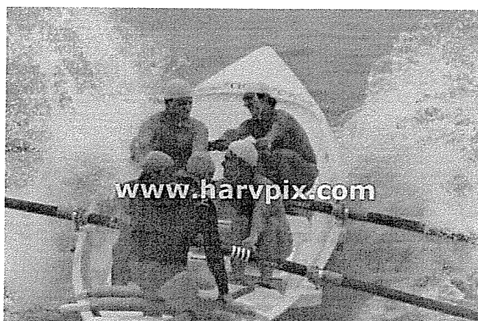
Left: Snapper's receiving their silver Aussies medal Above: Snapper's in action